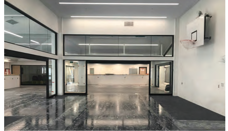
FUTURE GYM SPACE

When the new Sunny Hill opens on the BC Children's campus, kids and families will receive integrated care in one location, where the brightest medical minds will be able to collaborate in ways never before possible.