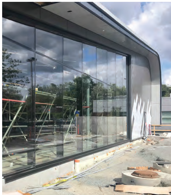
EXTERIOR OF FUTURE POOL